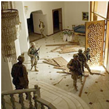
U.S. soldiers seize and clear Iraq's presidential palace resorts near Saddam International Airport in Baghdad.

Inside the new palace, U.S. troops found gold-painted faux French furniture, a hot tub, a barbecue pit and a TV in every room, according to a report from the Associated Press. But it seemed less akin to a home from Lifestyles of the Rich and Famous than it did to an executive conference center.