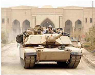
A U.S. tank helps secure the Abu Ghurayb Presidential Palace compound, Monday.

BAGHDAD — The Iraqi soldiers had fled by the time U.S. forces arrived Monday to take control of the old presidential palace in the heart of Baghdad.