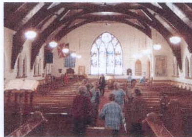
St. Alban's Cathedral

A couple of Photos from our fall tour to PA