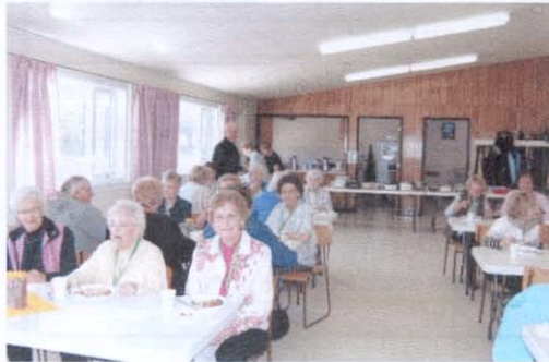
We enjoyed a pot-luck lunch at the Anglican Church Hall

2317 Arlington Avenue Saskatoon, SK S7J 2H8 Phone: (306) 373-3879 Fax (306) 374-1122 E-mail: sts@stf.sk.ca Web Site: www.sts.sk.ca