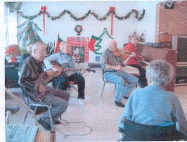
Tea at Sasko Park Lodge

December – We joined with Melfort Chapter to enjoy a turkey dinner Christmas Social. We also provided the lunch and arranged the entertainment for the Birthday Tea at Sasko Park Lodge.