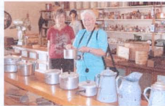
Checking out the pots & pans at the Melfort Museum

A couple of Photos from our fall tour to PA