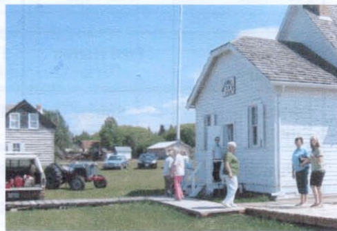
Checking out the School at the Melfort Museum