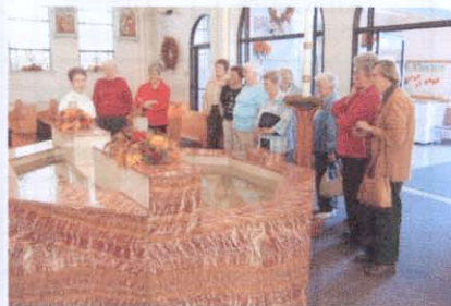
Sacred Heart Cathedral