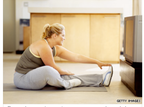
Research suggests exercise even once a week may help you maintain cognitive function as you age.

Can't find your keys ... again? Whether your momentary memory loss is linked to doing too many things at once or just a bad case of menopausal brain fog, you don't have to put up with it.