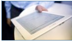
Blog: Amazon's Kindle going places, but rivals fast behind