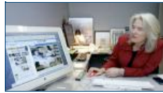
Blog: Content, convergence and creativity