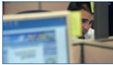
Online ads: Big Brother or customer service?