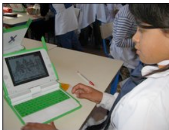
362,000 pupils in Uruguay now have the distinctive laptops.

"We have a lady who's been teaching for 30 years and when they gave us the computers and the training, she asked for leave because she didn't want to have anything to do with the programme. Later