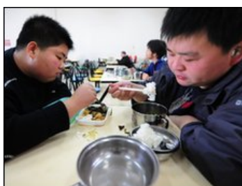
A change in lifestyle following rapid economic growth is partly to blame

China faces a diabetes epidemic, with almost one in 10 adults having the disease while most cases remain undiagnosed, researchers have said.