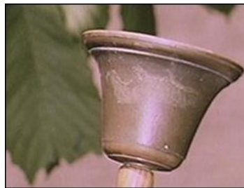
Handclaps are being used instead of school bells

The transitional government - backed by African Union troops and UN funds - controls only a small part of the capital, Mogadishu.