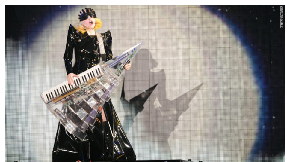
Did geek camp teach Lady Gaga to rock?