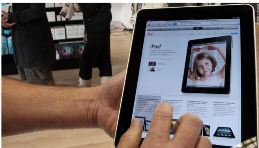
The iPad is a great tool for grandparents for the same reason candy is -- their grandkids love it.