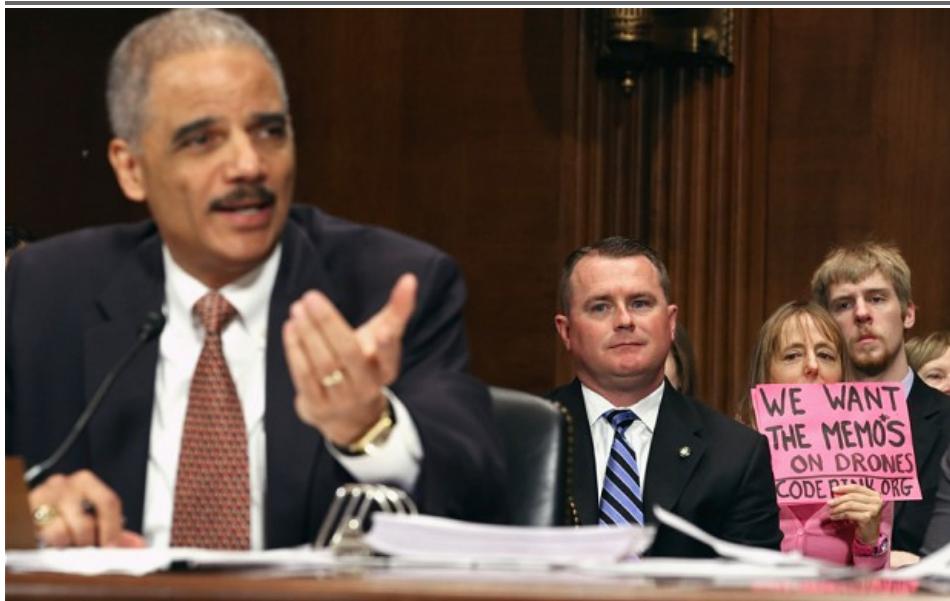
Eric Holder, left, testifies before the Senate Judiciary Committee as Code Pink demonstrator Medea Benjamin protests against the use of drone strikes.

President Barack Obama has the authority to use an unmanned drone strike to kill US citizens on American soil, his attorney general has said.