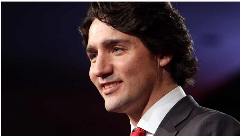
Justin Trudeau, the eldest son of former prime minister Pierre Elliott Trudeau, was elected on the first round with 24,668 points — he only needed to obtain 50 per cent plus one, or a total of 15,401 points

By Leslie MacKinnon and Susana Mas, CBC News Posted: Apr 14, 2013 3:02 PM ET | Last Updated: Apr 14, 2013 7:40 PM ET 200