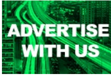
Advertise With Us