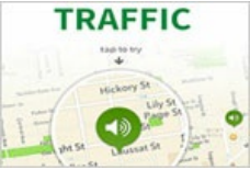
News1130 Traffic App