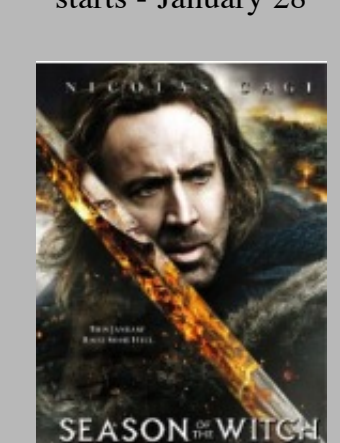
Melfort starts - January 28