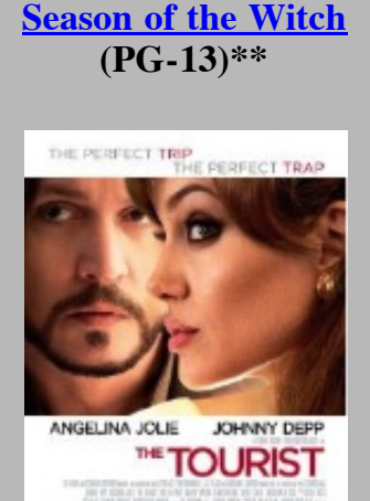
The Tourist (PG)**