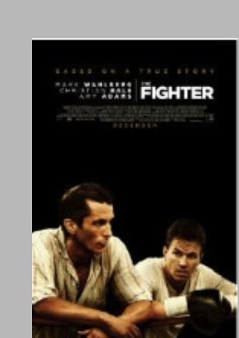
The Figher (R)***