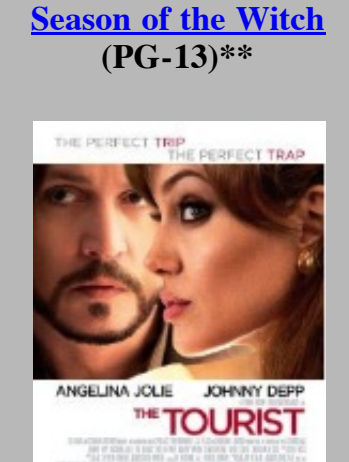
The Tourist (PG)**