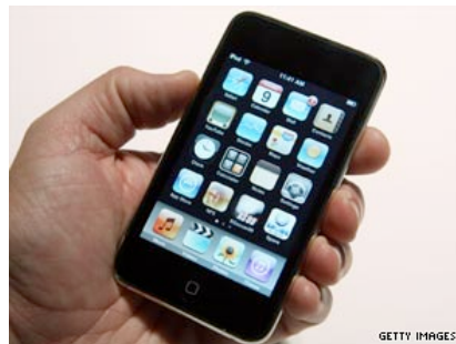
At HEC Paris, MBA students are given an iPod Touch so they can download podcasts of lectures.

LONDON, England (CNN) -- The wisdom of business professors, once only available to MBAs and business students, can now be accessed by anybody with an Internet connection.